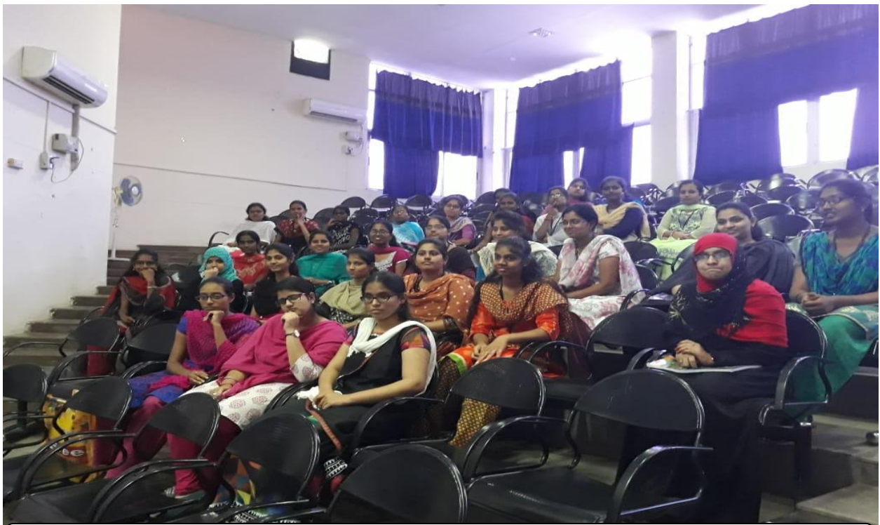
Audience of the Programme