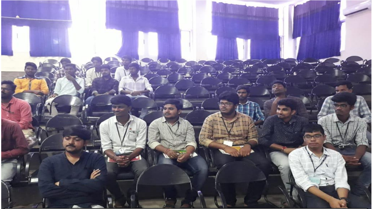
Audience of the Programme