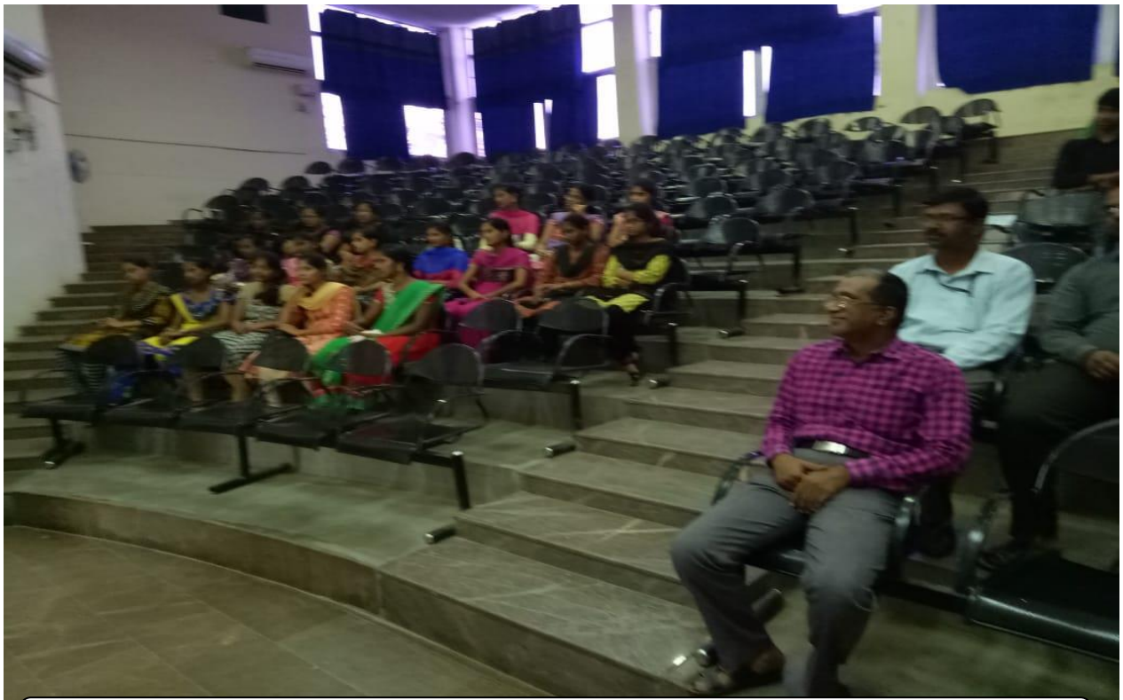
Audience of the Programme