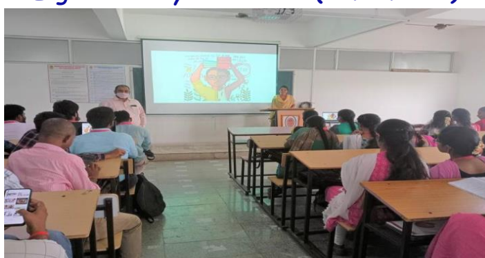
National Education day(11.11.2019)