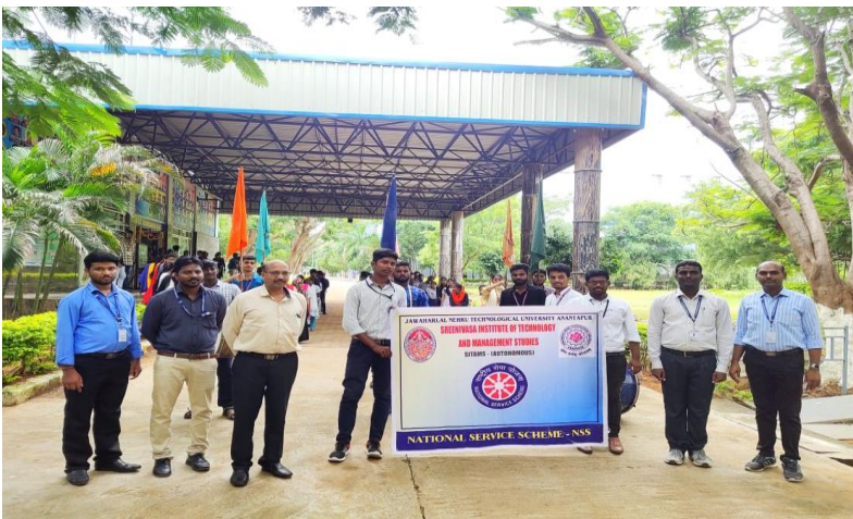
NSS Foundation Day Celebrations (24-09-2019)