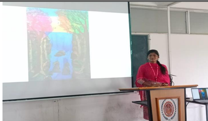
Children's Day Celebrations(13.11.2019)