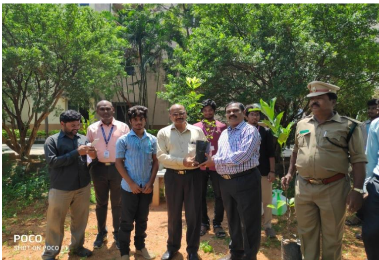
Tree Plantation and Distribution (01-10-2019)