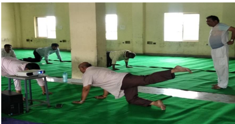
International Yoga Day Celebrations (21-06-2019)

Our students as NSS Volunteers continuously showing leadership skills and serving rigorously for community health care, literacy drives, environmental protection, Blood donation camps, informative lecture on human values regularly to the society by visiting nearby villages and educating and helping the poor and the destitute. This time NSS has also organized many activities.