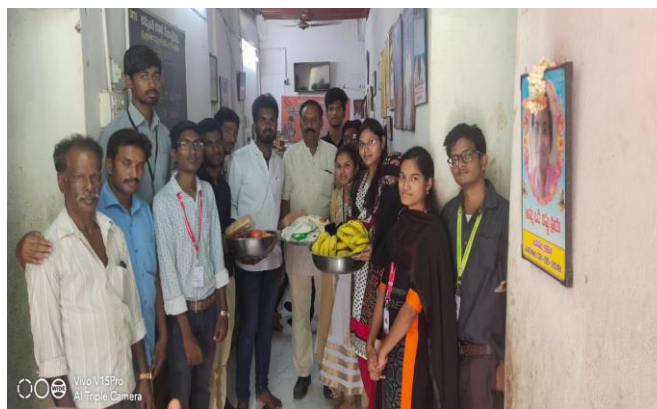
Provide Fruits, Bread and Milk to orphans in Old Age Home (AmmavodiAshramam) (11-07-2019)