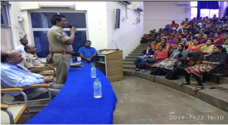
Anti Ragging Awareness to Students by Chittoor Police Department (23-07-2019)