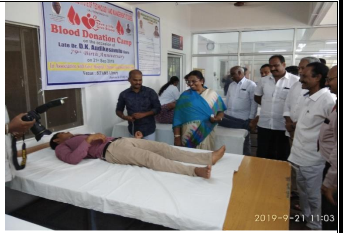
Blood Donation Camp (21-09-2019)