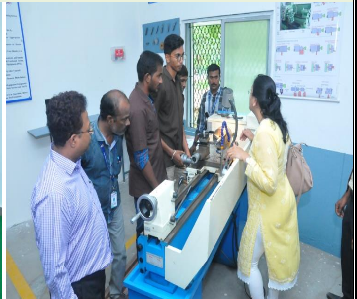
Standing Committee visit for NBA accreditation (30-08-2019, 31-08-2019 & 01-09-2019)