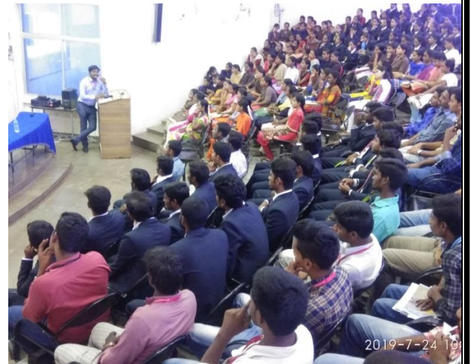
mPassPort APP Awareness to Students (24-07-2019)