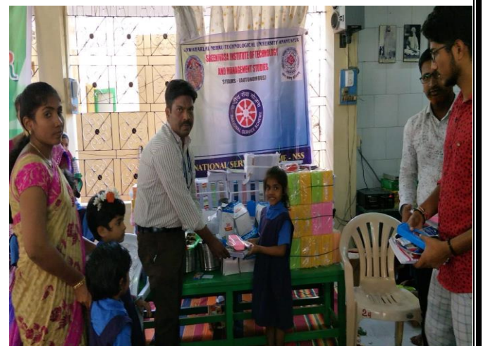
Student Kit Distribution to Poor Students who are studying in Govt. Schools in around Chittoor(19-08-2019)