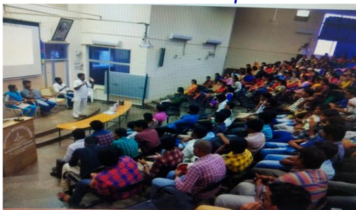
Teachers day Celebrations(05.09.2019)