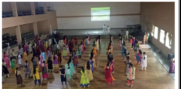
Self Defense Programme (19-07-2019)