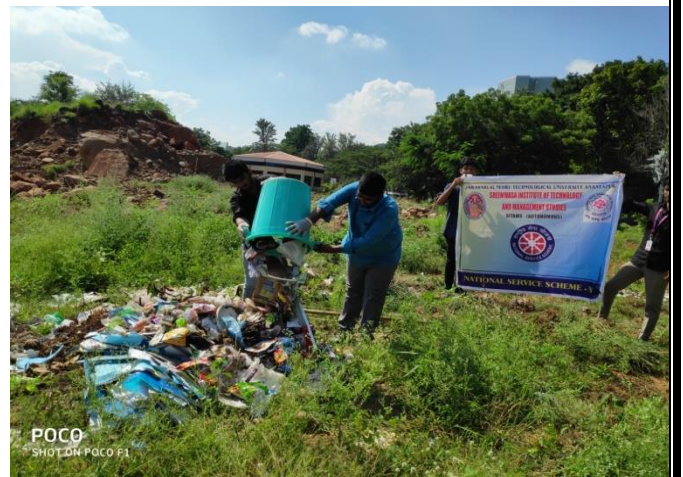
Campus Clean to make Plastic Free Campus (01-10-2019)