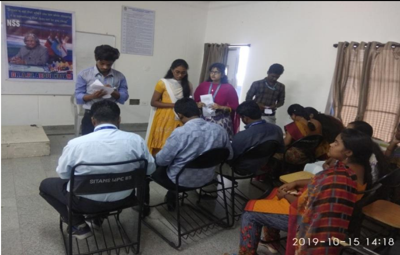
Quiz and Elocution Competitions on the eve of Dr.APJ.Abdul Kalam Birthday (15-10-2019)