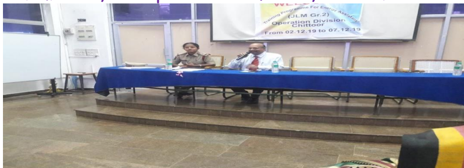
An Awareness camp "Anti Sexual Harassment" (07-12-2019)