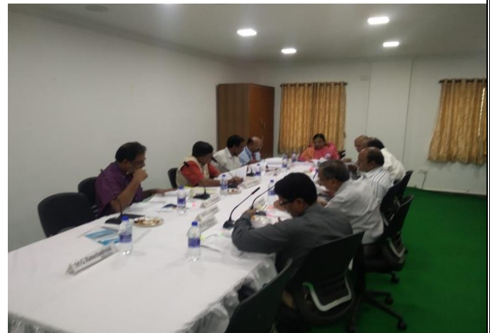
Governing Body Meeting (20-12-2019)