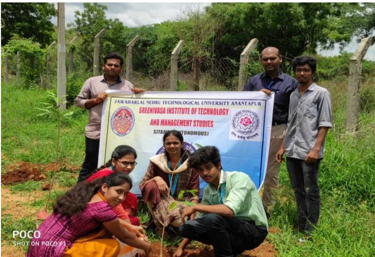
Tree Plantation in SITAMS Hostel (08-08-2019)