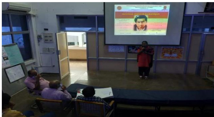
National Mathematics day(20.12.2019)