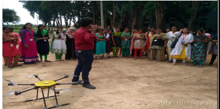
A 3-Day Entrepreneurship Awareness Camp(14-10-2019 to 16-10-2019)