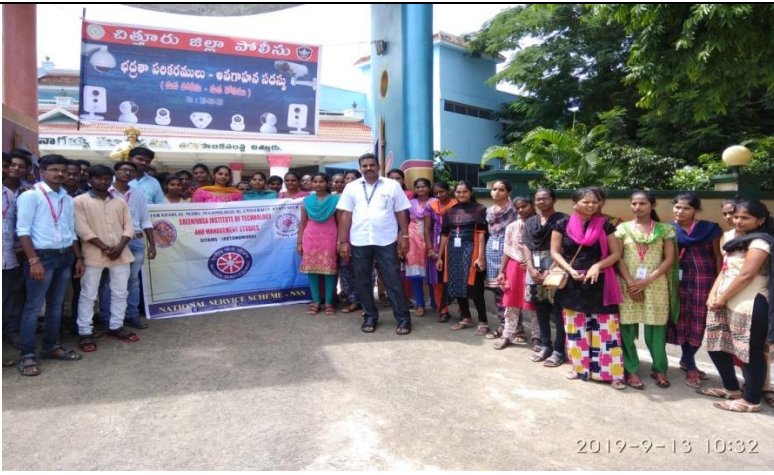
Participated in Awareness Program on "Our Safety in Our Hands" conducted by Chittoor Police Dept (13-09-2019)