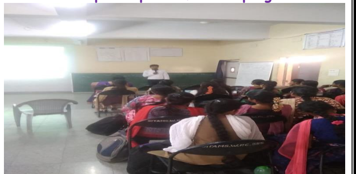
An Awareness Programme "Stress Management at the working place"(10-07-2019)