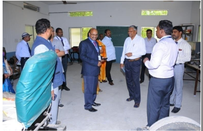
Standing Committee visit for extension of Autonomous status (14-06-2019 & 15-06-2019)