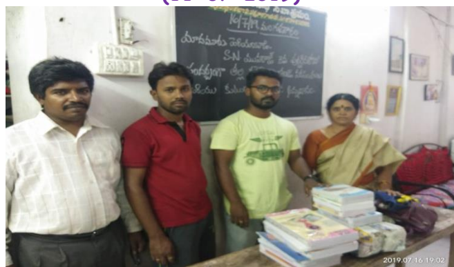
Provided Note Books to Orphan Students who are staying in Amma VodiAshramam (17-07-2019)