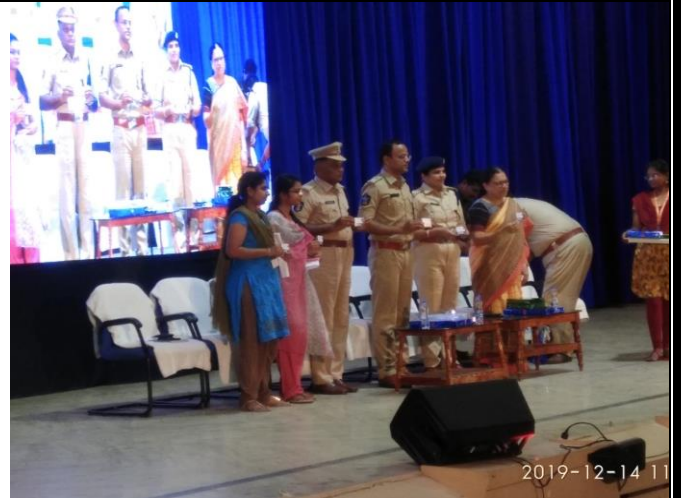
NSS Volunteers participated in Awareness Program conducted by Police Department, Chittoor (18-10-2019)