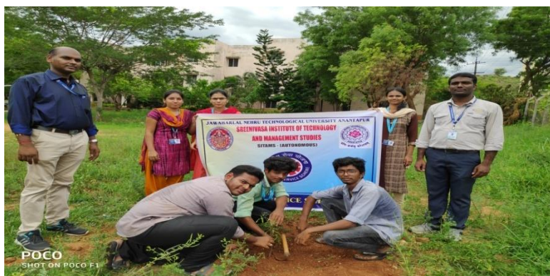
Tree Plantation in SITAMS (12-07-2019)