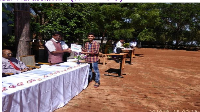
Independence Celebrations (15-08-2019)