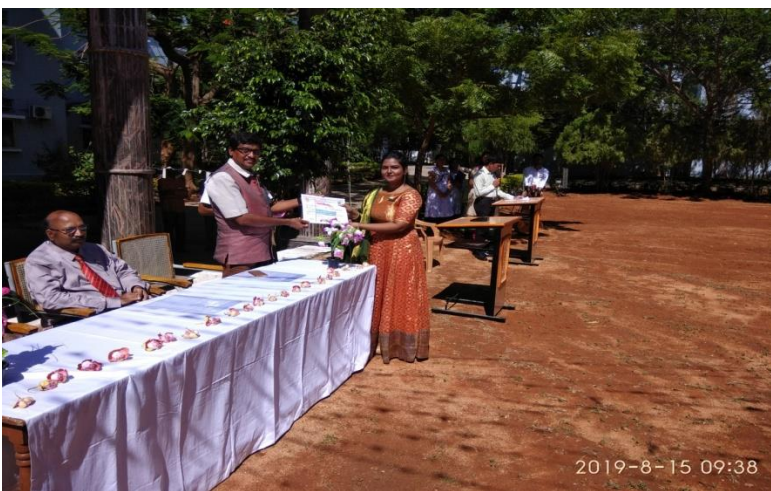
Independence Day Celebrations (15-08-2019)