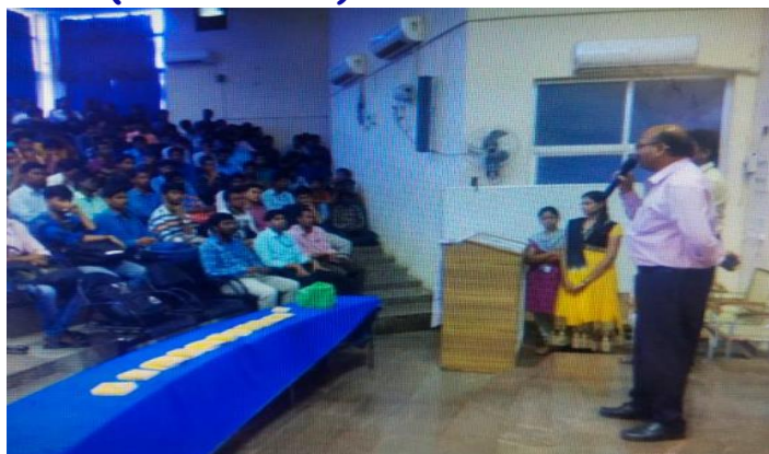
Engineer's day Celebrations(15.09.2019)