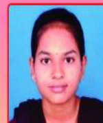
VELKUR CHARIKA 18751A04H0 9.5 GPA