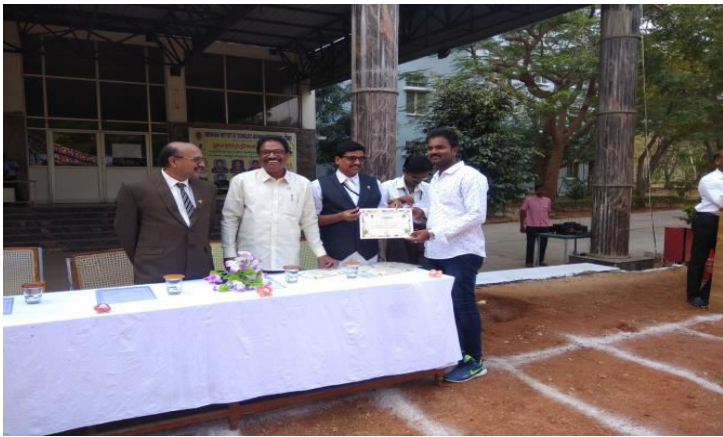
Republic Day Celebrations - Certificates distribution to NSS students (26-01-2019)