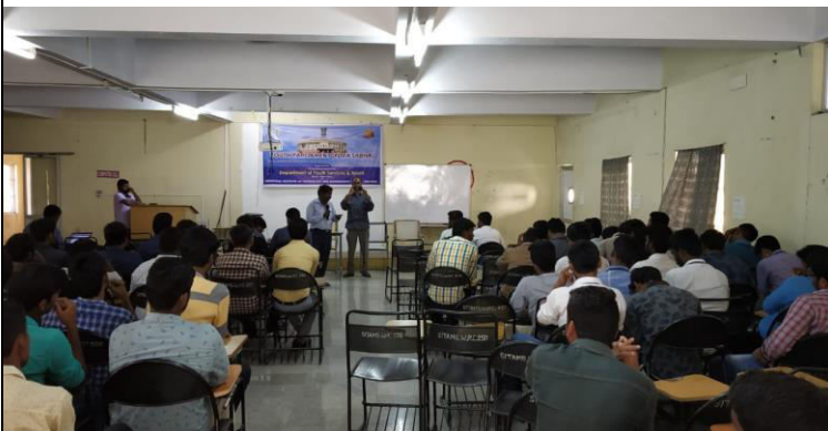
National Youth Day Competitions (Elocution and Poster Presentation) - (12-01-2019)