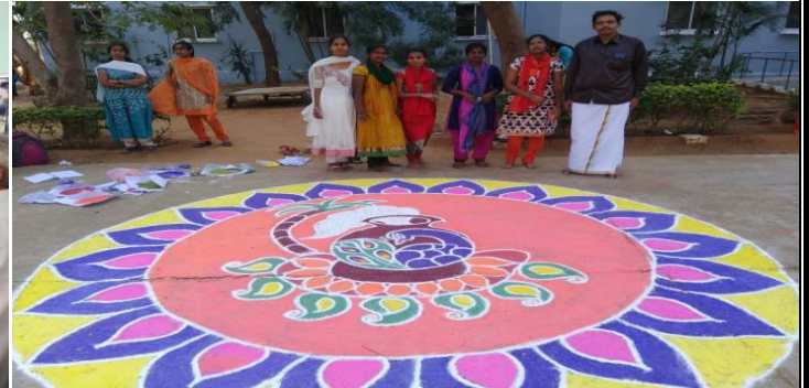
Sankranti Festival Celebrations in Campus (12-1-2019)