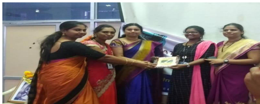
International Women's day celebrations(08-03-2019)