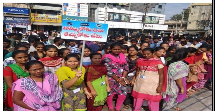
Participated in Voters Day Awareness Program (25-01-2019)