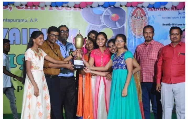
Annual day(SITAMS VAIBHAV 2K19) (03-04-2019 & 04-04-2019)