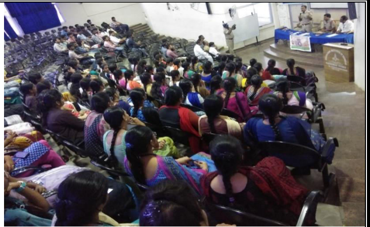
Awareness on Suggestion and Compliant Box by Chittoor Police Dept(30-01-2019)