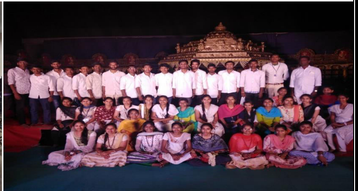
SITAMS NSS Volunteers Participated to do SEVA in Srivaari Kalyanothsavam conducted in Chittoor (23-02-2019)