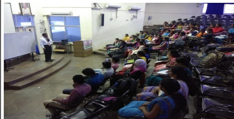
Health Awareness Program By Health Specialist (24-01-2019)