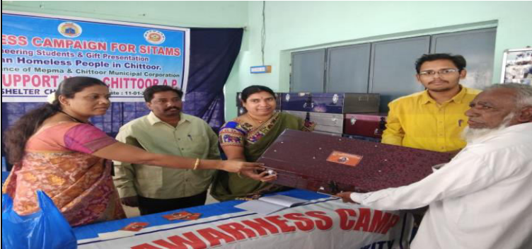
Donated Luggage Keeping Iron Boxes for Night Shelter Orphans in Chittoor (11-01-2019)

Our students as NSS Volunteers continuously showing leadership skills and serving rigorously for community health care, literacy drives, environmental protection, Blood donation camps, informative lecture on human values regularly to the society by visiting nearby villages and educating and helping the poor and the destitute. This time NSS has also organized many activities.