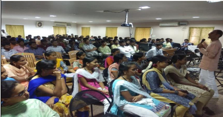
Art of Living Program by WYCM (World Youth Change Makers) Organization, Chennai (11-02-2019)