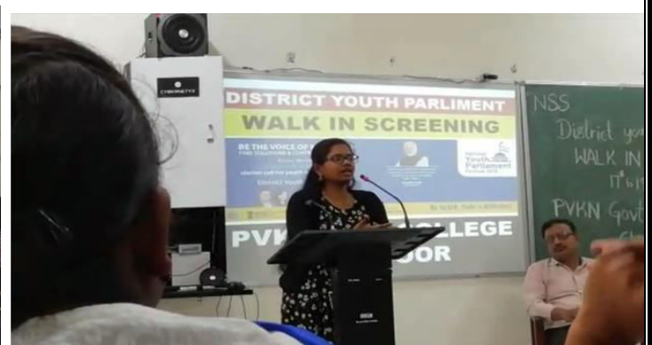
Participated in District Level Youth Parliament Screening test (19-01-2019)