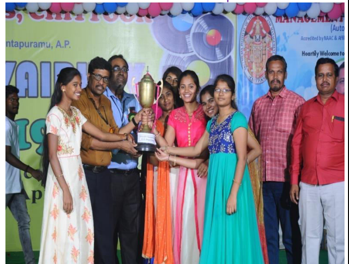
Annual Day (SITAMS VAIBHAV 2K19) (03-04-2019 & 04-04-2019)