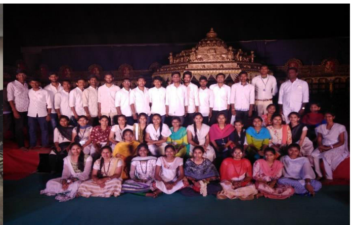
SITAMS NSS Volunteers Participated to do SEVA in Srivaari Kalyanothsavam conducted in Chittoor (23-02-2019)