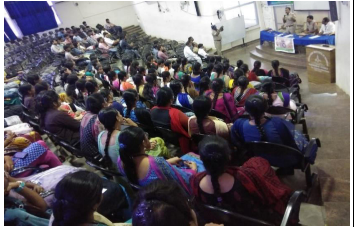
Awareness on Suggestion and Compliant Box by Chittoor Police Dept(30-01-2019)