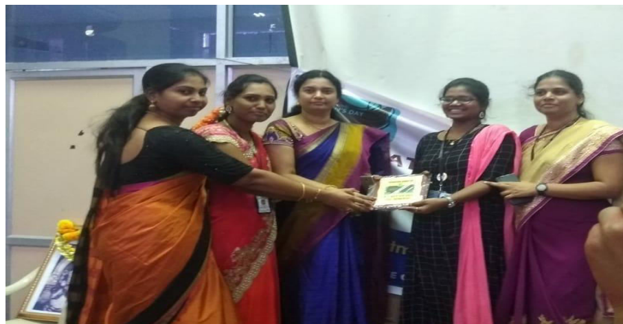
International Women's day celebrations(08-03-2019)