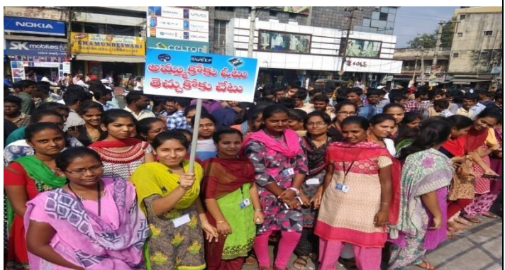
Participated in Voters Day Awareness Program (25-01-2019)