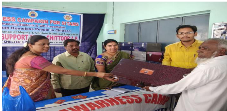
Donated Luggage Keeping Iron Boxes for Night Shelter Orphans in Chittoor (11-01-2019)

Our students as NSS Volunteers continuously showing leadership skills and serving rigorously for community health care, literacy drives, environmental protection, Blood donation camps, informative lecture on human values regularly to the society by visiting nearby villages and educating and helping the poor and the destitute. This time NSS has also organized many activities.