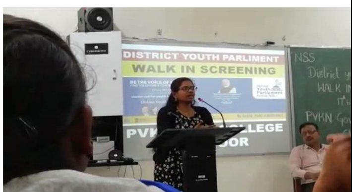
Participated in District Level Youth Parliament Screening test (19-01-2019)