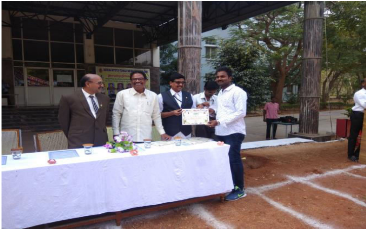
Republic Day Celebrations - Certificates distribution to NSS students (26-01-2019)