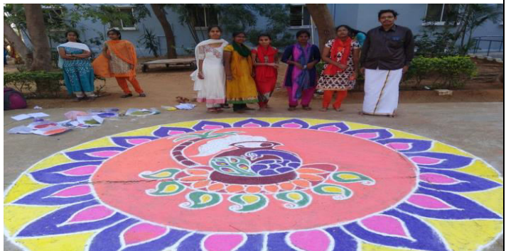
Sankranthi Festival Celebrations in Campus (12-1-2019)