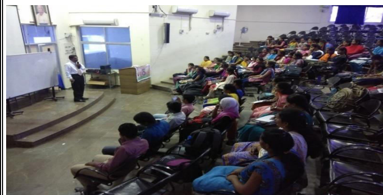
Health Awareness Program By Health Specialist (24-01-2019)