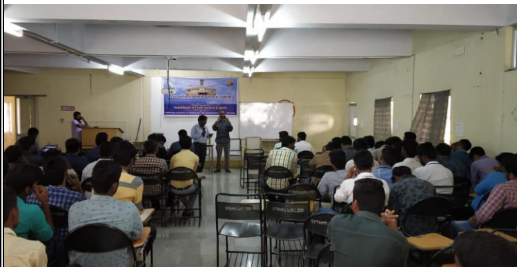
National Youth Day Competitions (Elocution and Poster Presentation) - (12-01-2019)