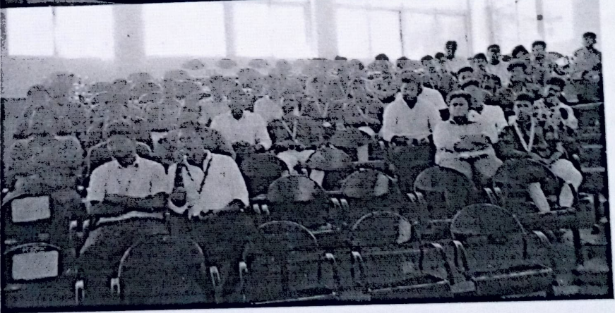
Audience of the Programme