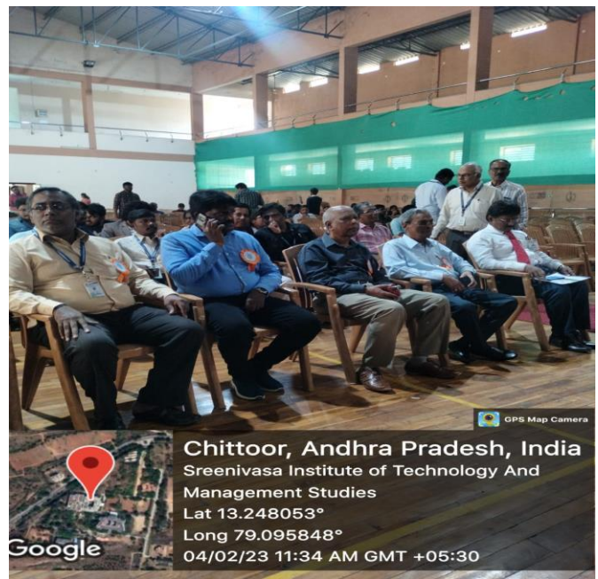
Alumni Meet on 04-02-2023