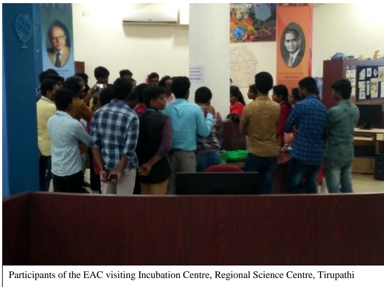
Participants of the EAC visiting Incubation Centre, Regional Science Centre, Tirupathi

After attending three-day awareness camp, students were enlightened and got awareness on getting an idea and starting a new business. By industry visit, they have experienced various processes involving industry.