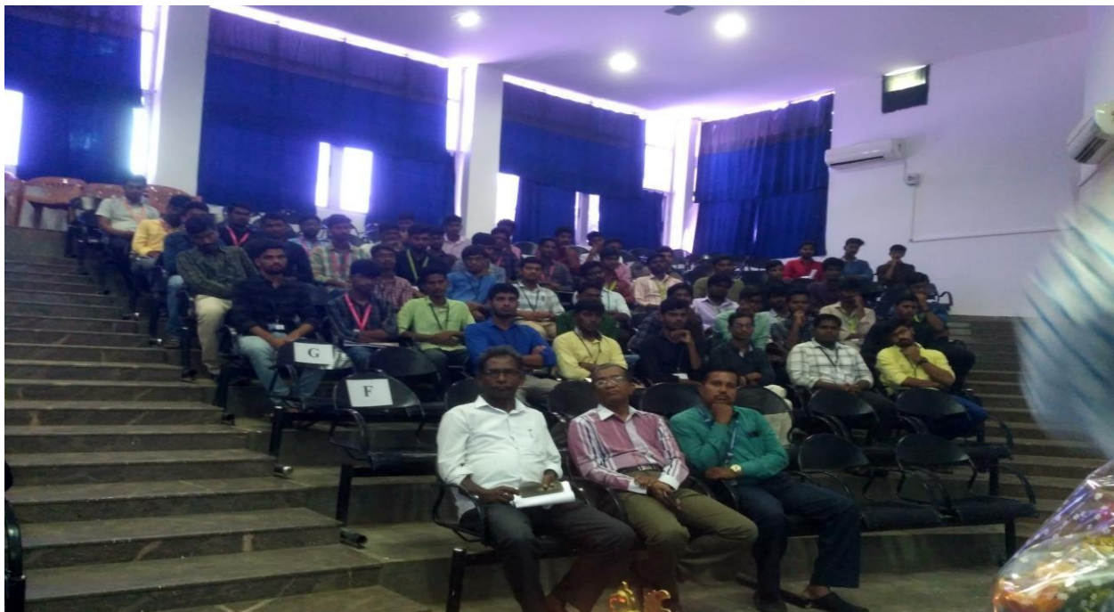
Audience of the Programme