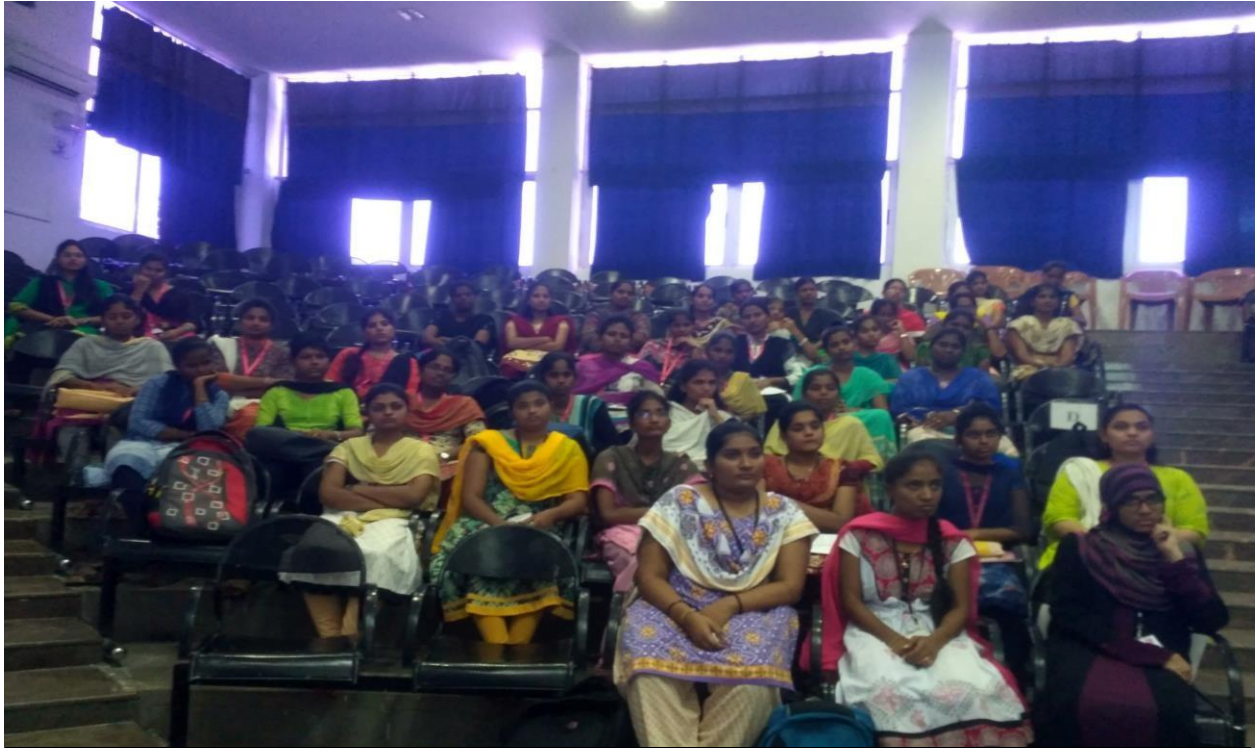
Audience of the Programme