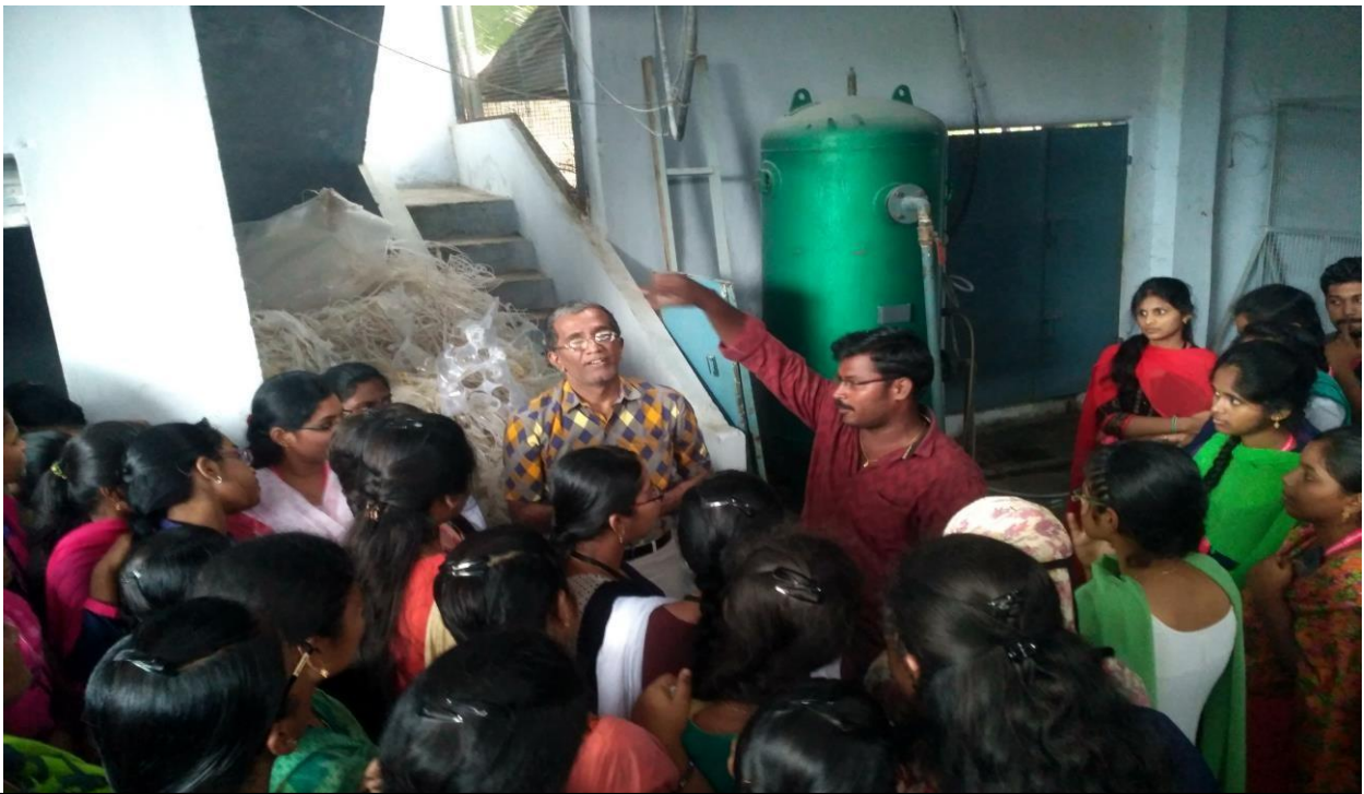
General Manager of an Enterprise is explain about the process of production