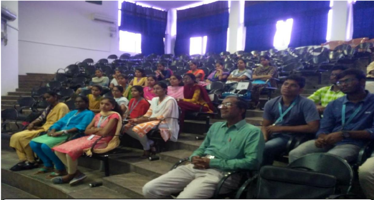
Audience of the Programme