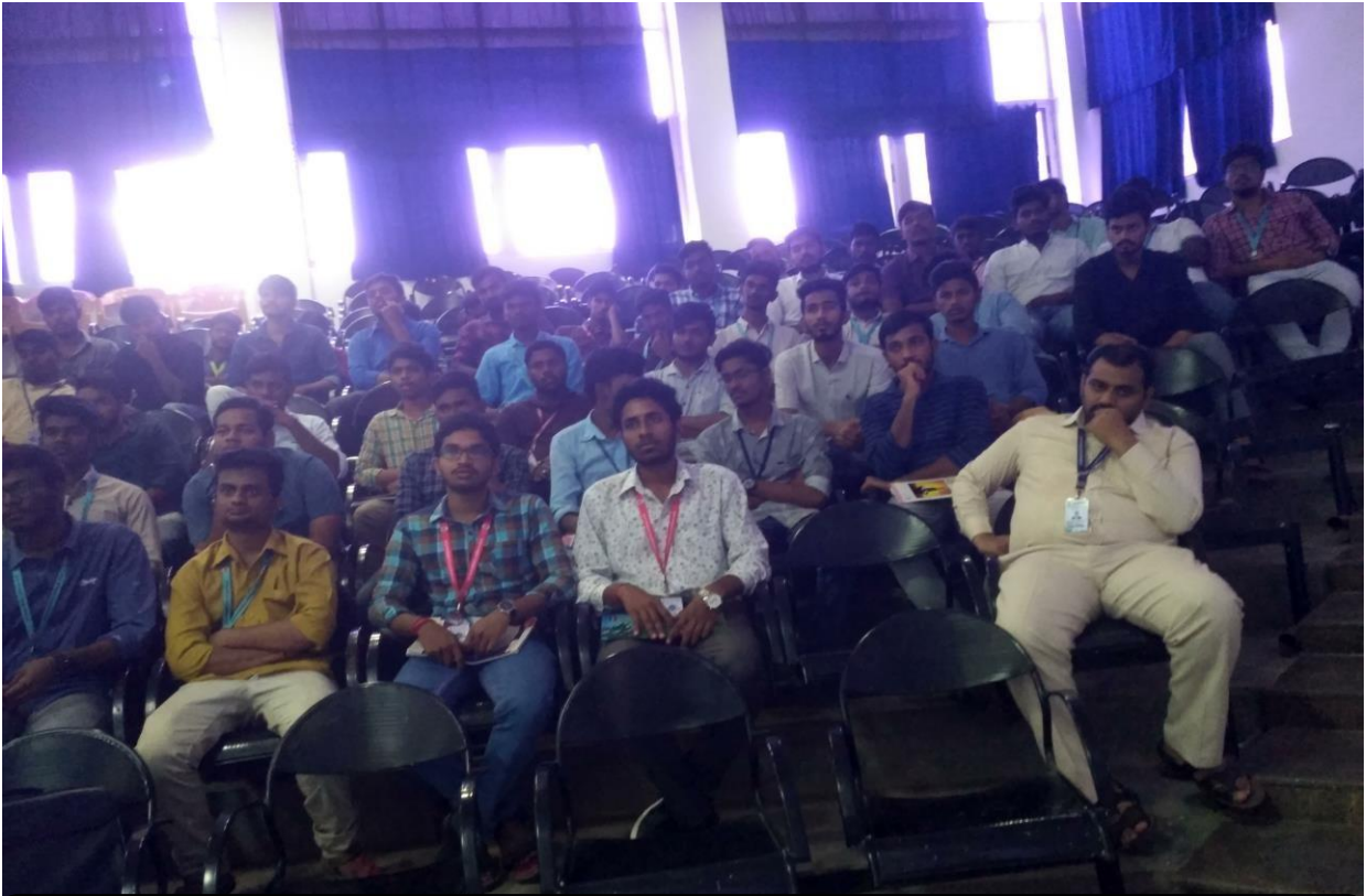
Audience of the Programme