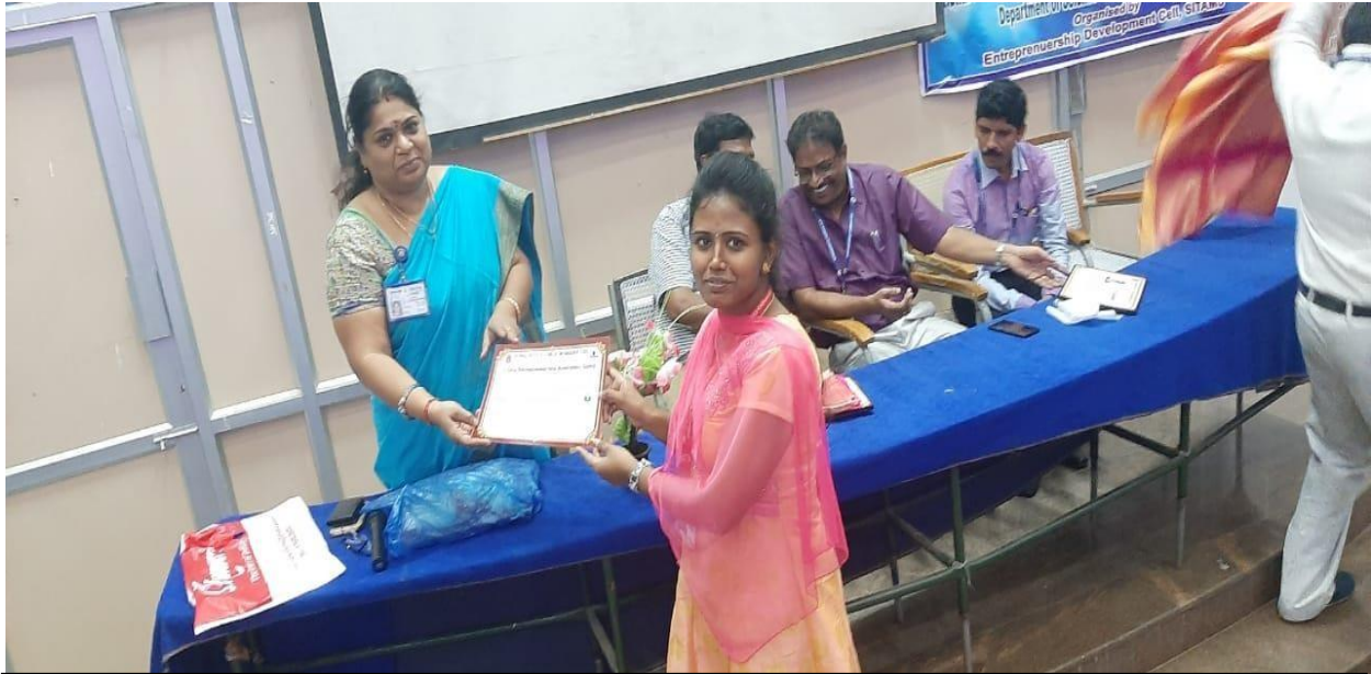
Certificates Distribution to the Participants

After attending three-day awareness camp, students were enlightened and got awareness on getting an idea and starting a new business. By industry visit, they have experienced various processes involving in industry.