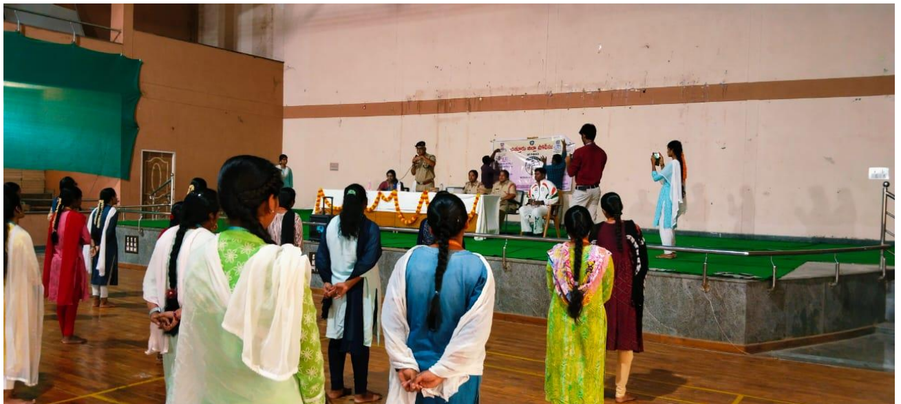
An awareness Program conducted on sexual harassment and ragging on 22.06.2024.

SITAMS NSS unit as organized various awareness programs on anti-ragging, Street corner meeting and rally campaign to create awareness among the students regarding anti-ragging.