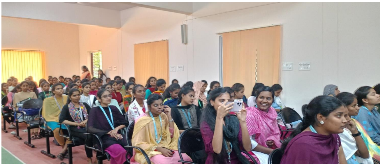
An awareness Program conducted by District police officers on sexual harassment and ragging on June 2024