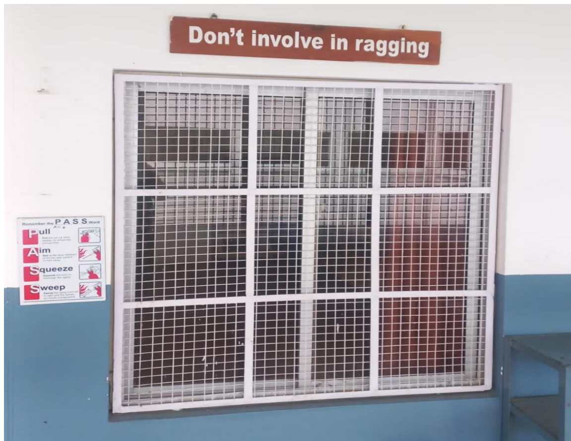
Awareness Board in Computer block:

Dr. D.K. Audikesavulu Marg (Bangalore-Tirupati Bye-pass Road), Murukambattu Post, CHITTOOR – 517 127