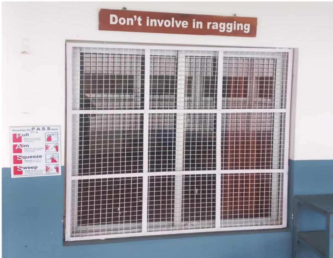
Awareness Board in Computer block:

Dr. D.K. Audikesavulu Marg (Bangalore-Tirupati Bye-pass Road), Murukambattu Post, CHITTOOR – 517 127