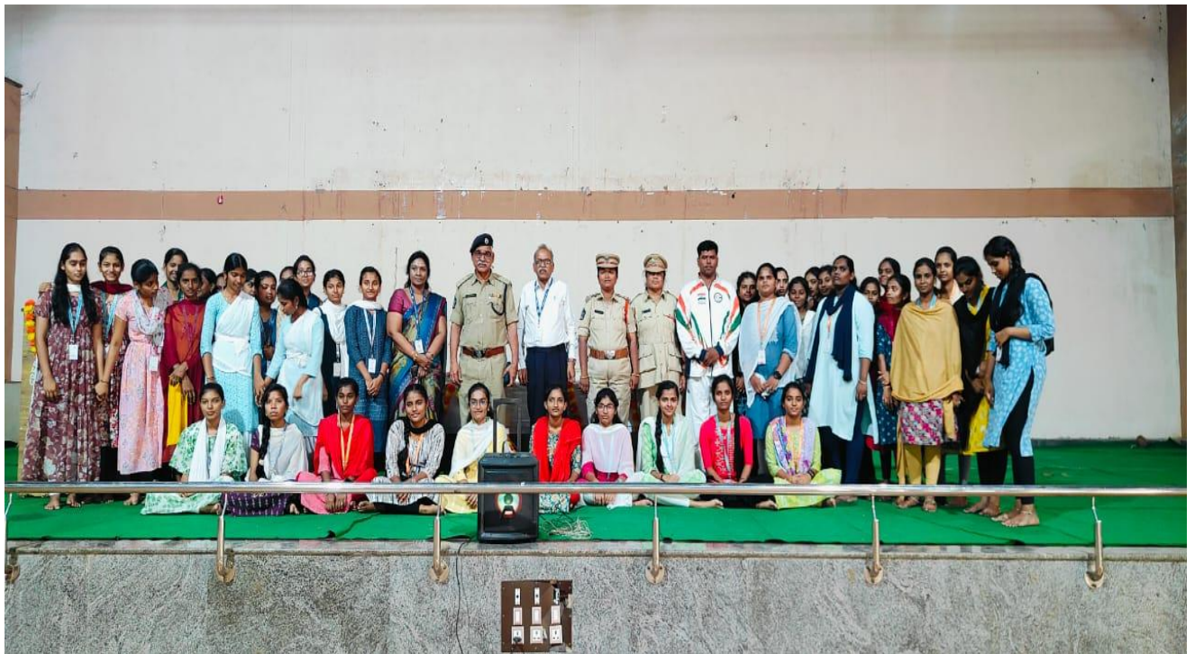
An awareness Program conducted on sexual harassment and ragging on 15.04.2025.

SITAMS NSS unit as organized various awareness programs on anti-ragging, Street corner meeting and rally campaign to create awareness among the students regarding anti-ragging.