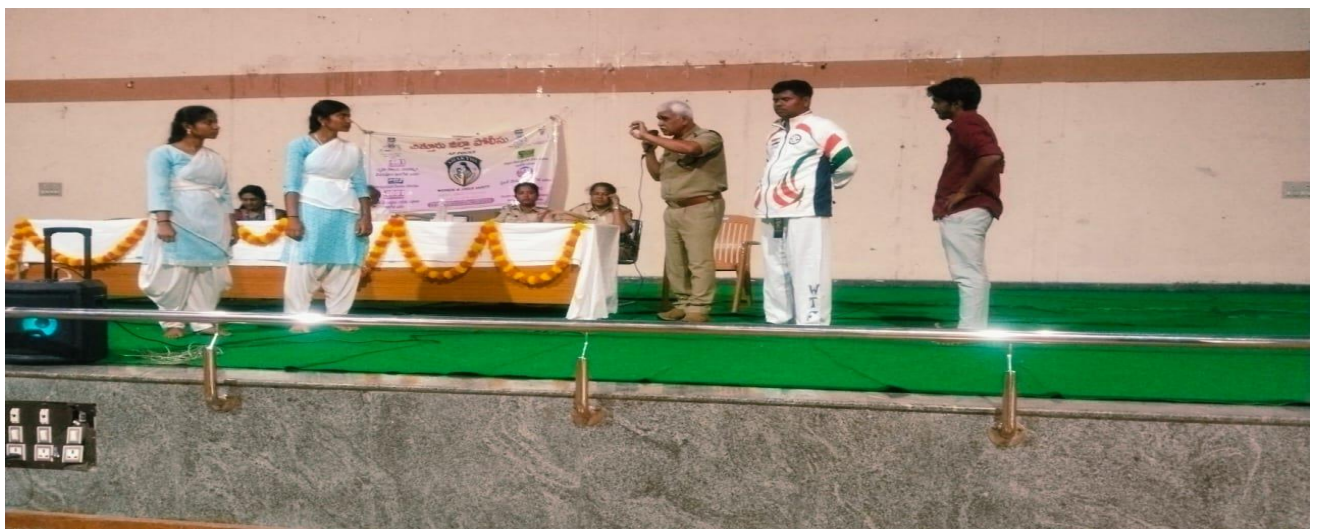
An awareness Program conducted by District police officers on sexual harassment and ragging on April 2025.